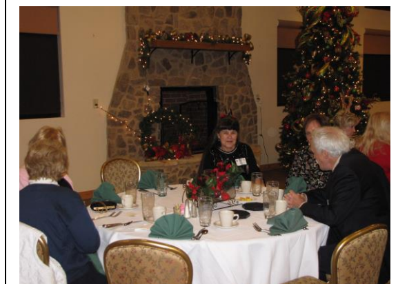
Members enjoying themselves at the Holiday Party at the Overlook