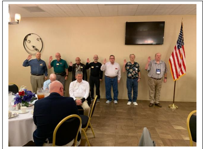
New Chapter Officers being sworn in