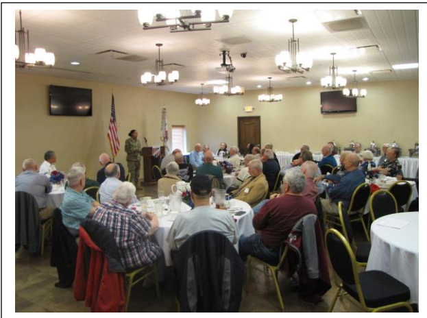
Largest crowd we have had in quite some time – over 50 members