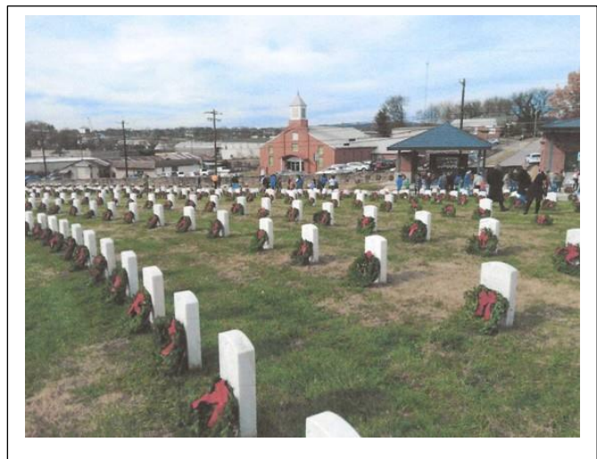
Wreaths Across America