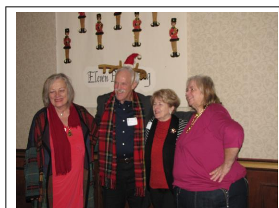
Members enjoying the Chapter Christmas Party