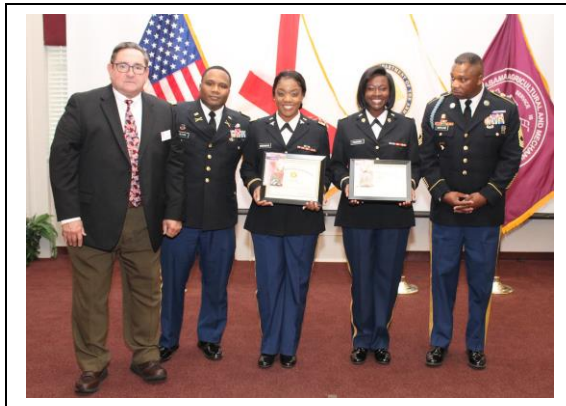
Gold Bar Ceremony at Alabama A&M University