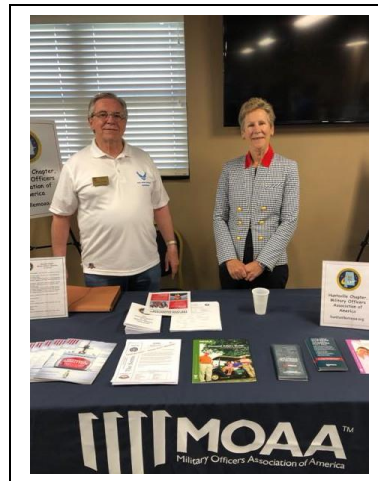
Golf tournament, RAD and September member meeting